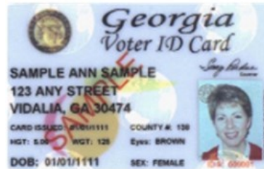
Example of a Georgia Voter Identification Card

If you DO NOT have one of these forms of ID, you can receive a FREE Georgia Voter ID card. Just contact your county registrar's office. For more information, call 404-656-2871.